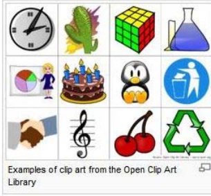
Examples of clip art from the Open Clip Art Library

http://en.wikipedia.org/wiki/Open_Clip_Art_Library